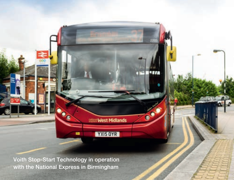
Voith Stop-Start Technology in operation with the National Express in Birmingham