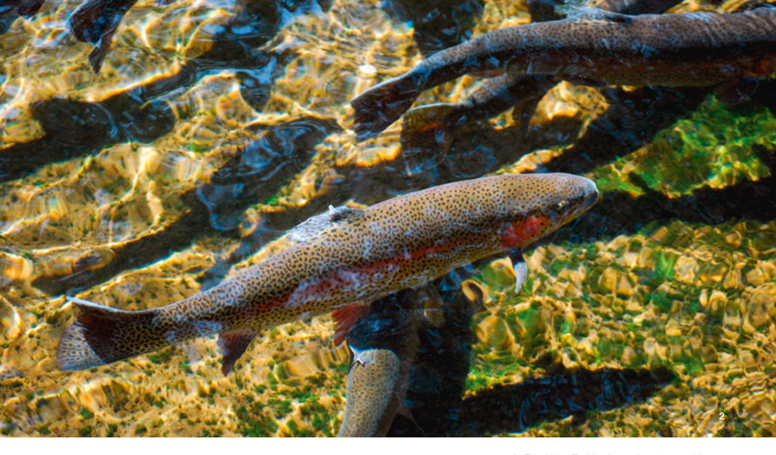
2 The Alden Turbine is predicted to provide survival rates of 98% to 100%.