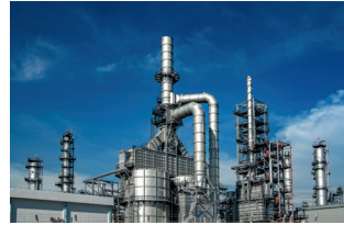
Power, oil, and gas

OnCare.InSight enables AI-based predictive maintenance across industries like power, oil and gas, petrochemicals, steel, and mining for a wide range of use cases.