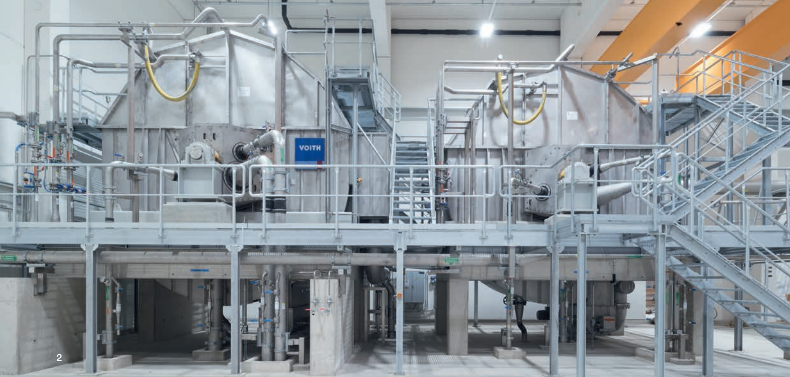
1 Inspection of a disc filter by Voith experts