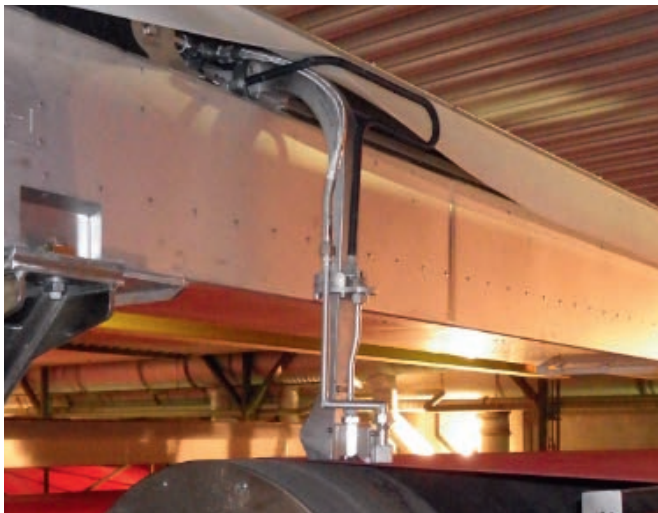
Dryer fabric cleaner in operation