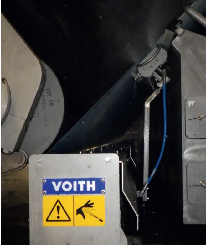
Forming fabric cleaner in operation