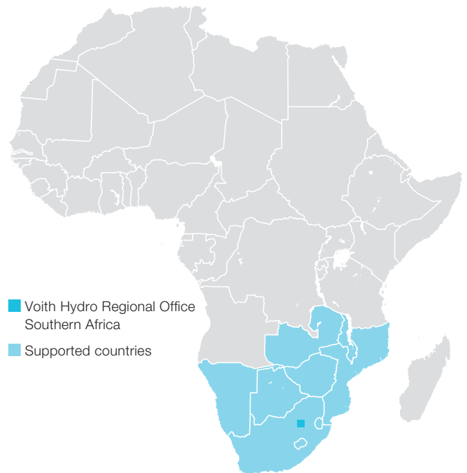
Voith Hydro Southern Africa hub and supported countries

1 The Ingula Bedford Dam in South Africa.