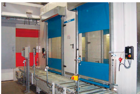
Air locks at inlet and outlet of cooling tunnel minimize entry of humidity

makes a highly efficient and gentle cooling down of the product both with critical packaging and partially loaded pallets possible. With the double-track design ContiCool technology, the system control determines the optimum track allocation depending on the individual cooling times. Thereby a process optimized cooling of the product is achieved at minimized power consumption.