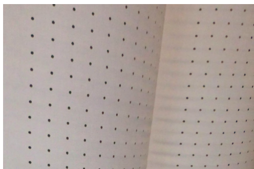
High throughputs at low energy demand with FlexShell

times for critical packaging can significantly be reduced by up to 30%, in comparison to conventional systems. Intelligent automation modules are integrative components of Voith pallet cooling systems and enable an operating method at lowest operational costs, ensure defrosting of air coolers as needed or utilize product specific data for self-optimization of the system.