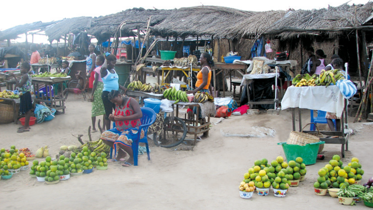
Local market near Cambambe

Operated by Empresa Nacional de Electricidade (ENE), the Cambambe plant resides on the banks of the Kwanza River on the border of the Kwanza Norte and Bengo provinces in Angola. First installed in 1963, the facility was damaged during the political instability in the last decades.